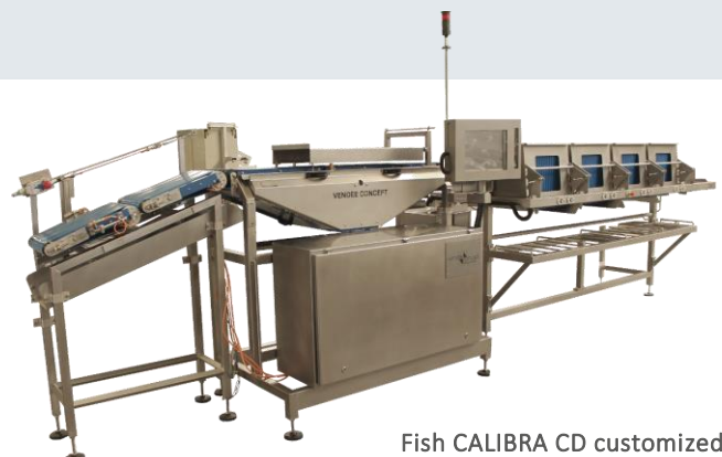
Fish CALIBRA CD customized